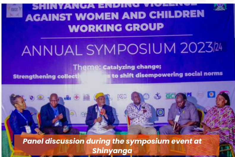
Panel discussion during the symposium event at Shinyanga