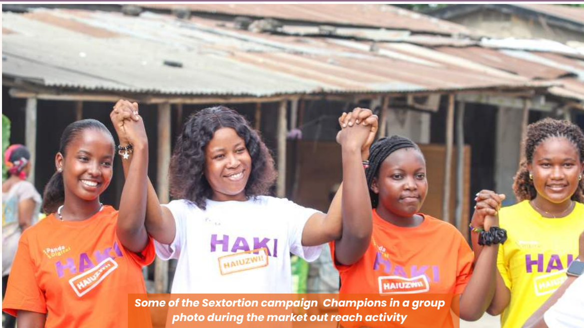
Some of the Sextortion campaign Champions in a group photo during the market outreach activity

“We also recruited and conducted capacity-building to sextortion champions to equip them with essential knowledge on sextortion, including its nature, occurrence, and proper reporting procedures. This empowered them to be able to advocate effectively for prevention and response within their communities,” he added.