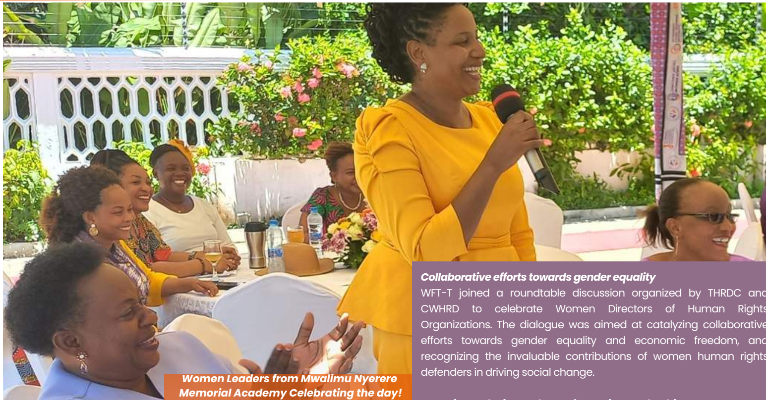
Women Leaders from Mwalimu Nyerere Memorial Academy Celebrating the day!