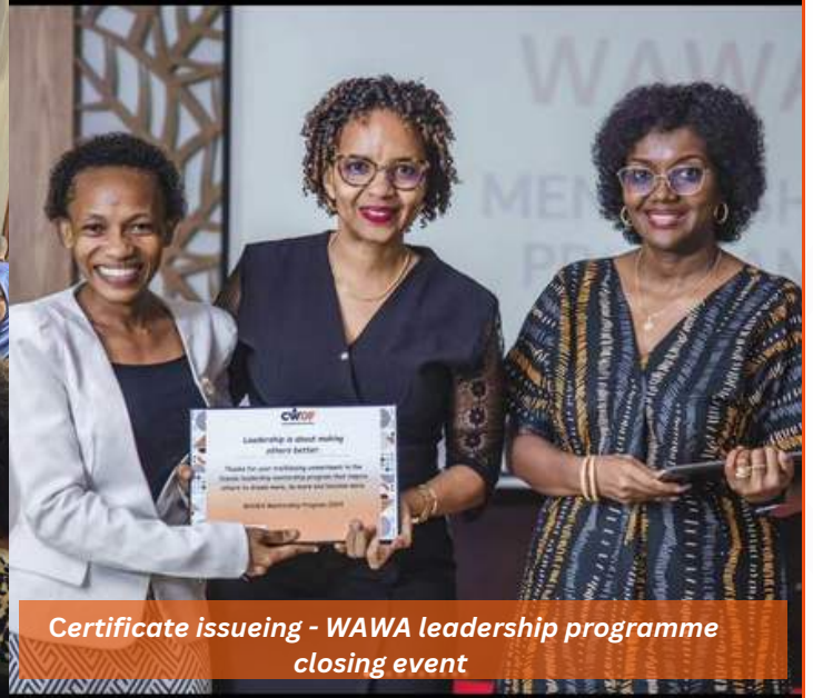
Certificate issuing - WAWA leadership programme closing event