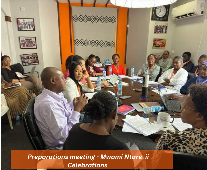
Preparations meeting - Mwami Ntare ii Celebrations