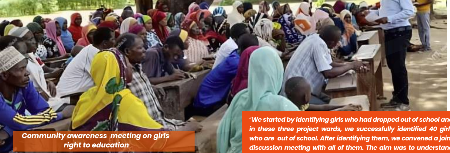
Community awareness meeting on girls right to education

Life is never easy for many young girls in Mtwara as the road to achieving their life dreams remains uncertain. They face a lot of challenges in their mission to attain education.