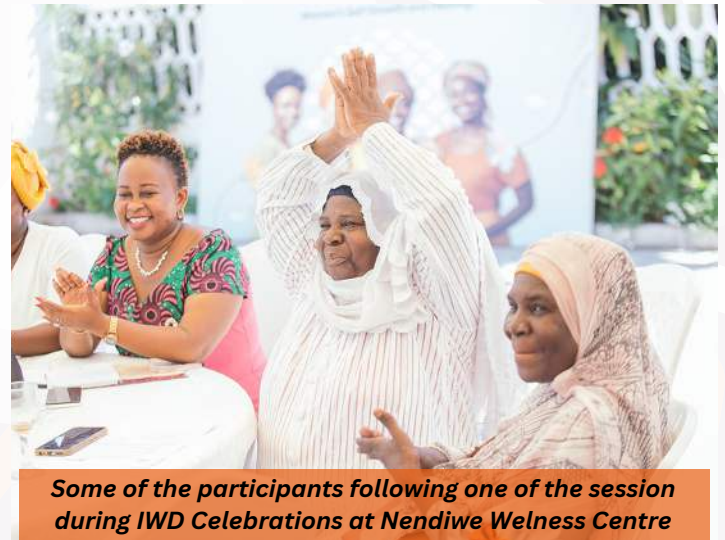
Some of the participants following one of the session during IWD Celebrations at Nendiwe Wellness Centre